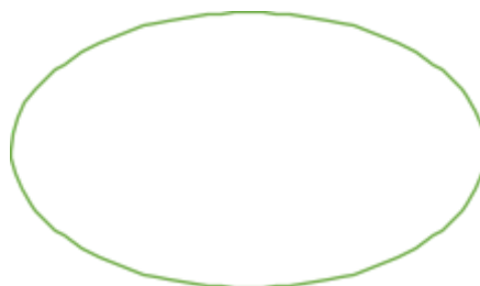
Left thumb impression