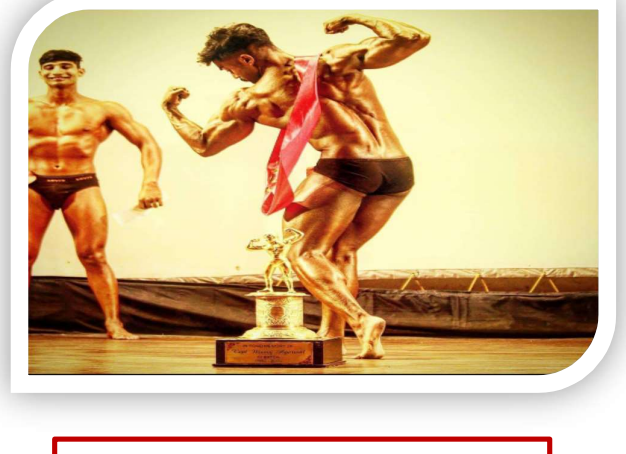
'MR AFMC' COMPETITION