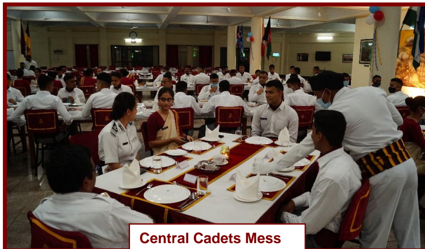
Central Cadets Mess

4. The above guidelines are not comprehensive and are subject to revision from time-to-time. The Medical Board will be guided by departmental instructions issued from time-to-time. The above guidelines are for the information of candidates only.