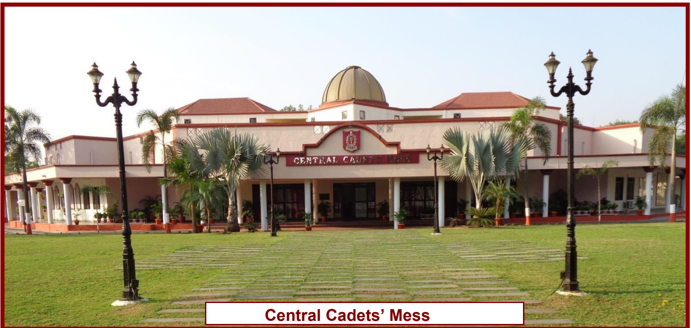
Central Cadets' Mess

29. Messing Facility: All medical cadets residing in the hostel are required to be members of the Mess attached to the hostel. Vegetarian / Non-vegetarian food is served in the cadets' mess as per the choice of the medical cadets.