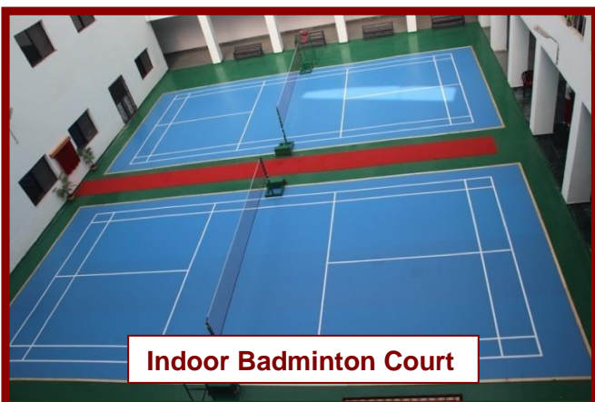
Indoor Badminton Court