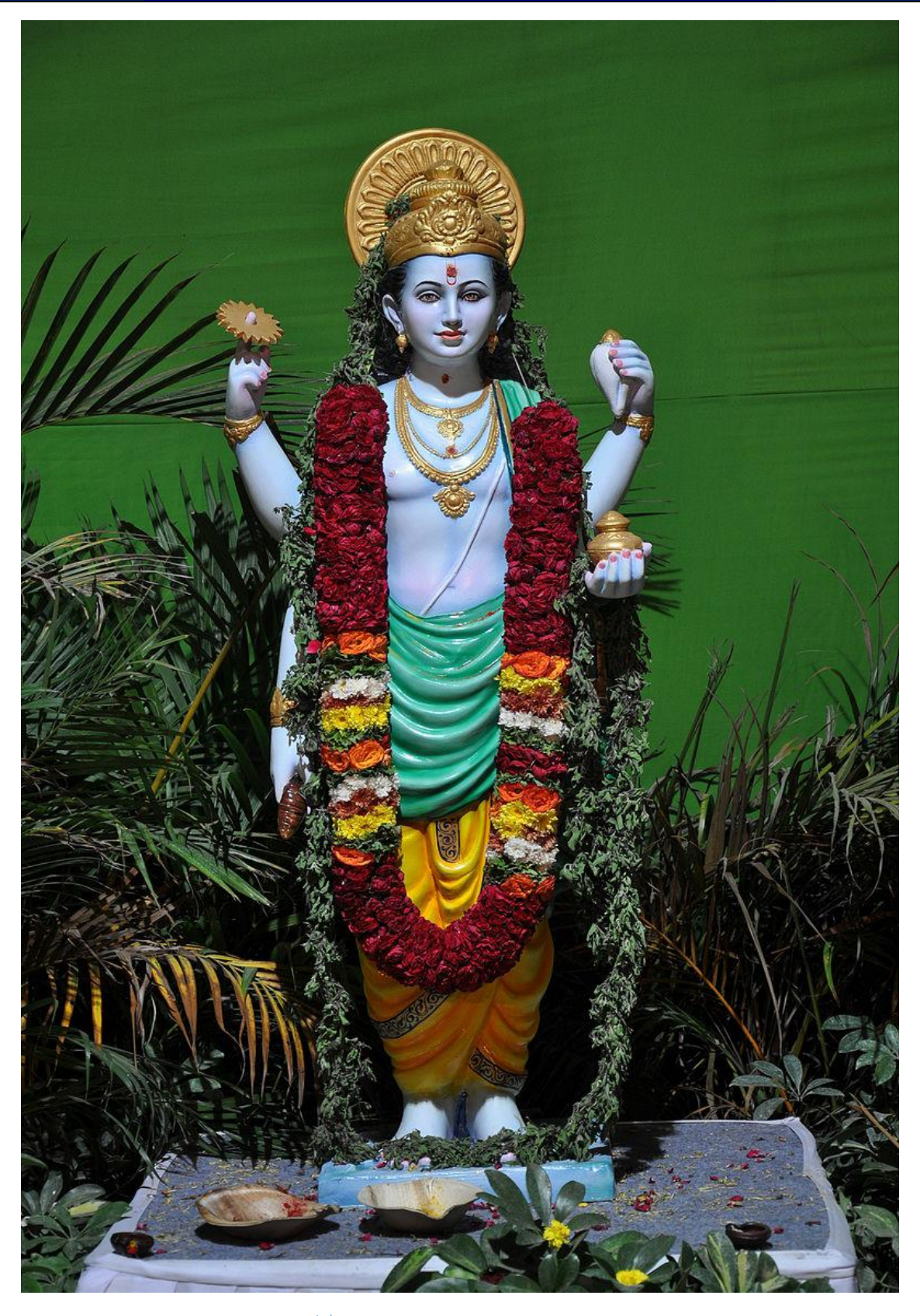
| श्री धन्वंतरये नमः||